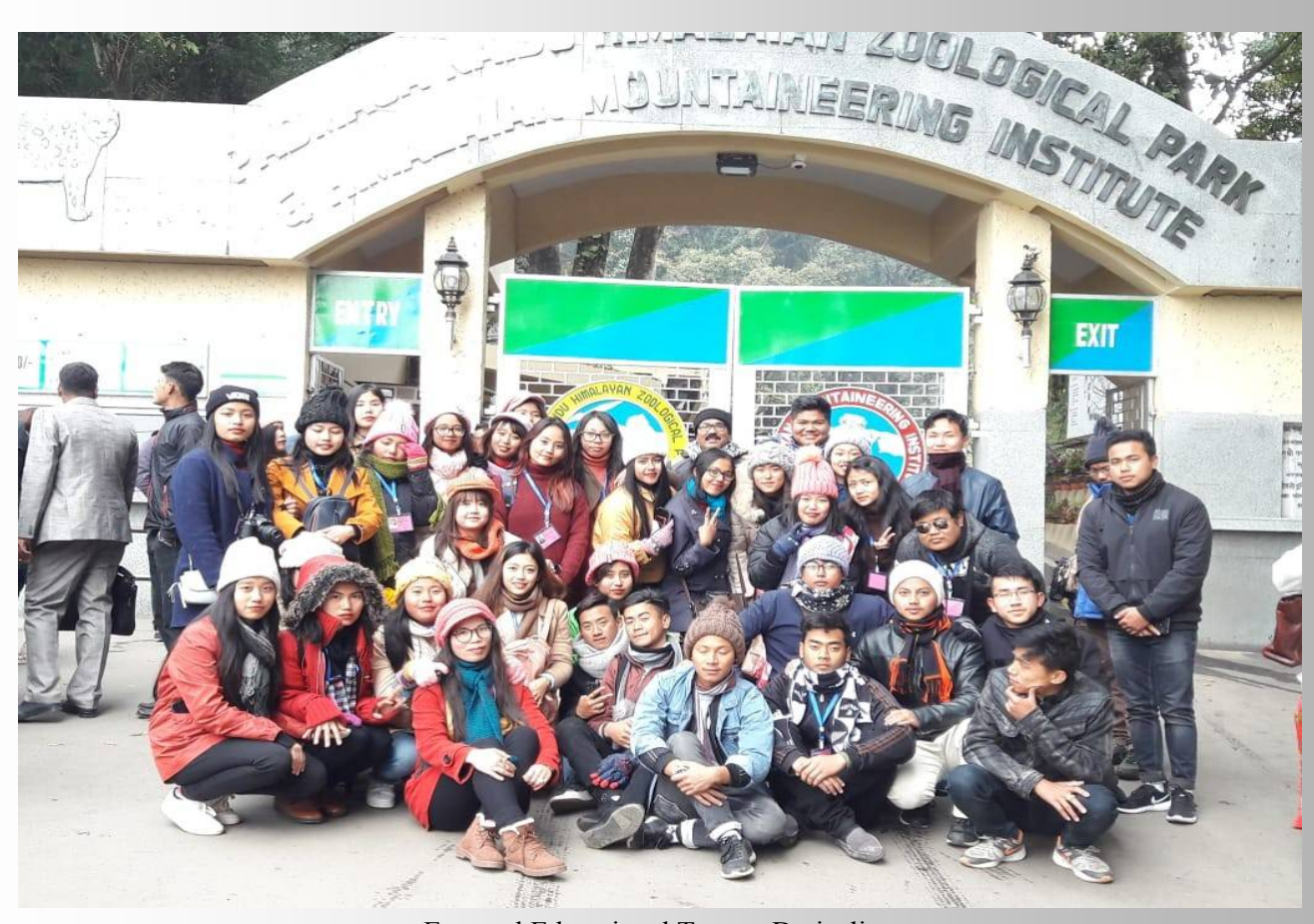
External Educational Tour to Darjeeling