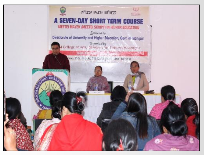
Seven-Day Short Term Course on Meetei Mayek Script held from 24th to 30th Dec,2019