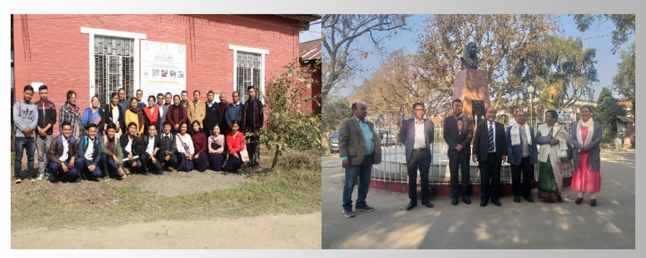
Launching of Unnat Bharat Abhiyan as a Participating Institute