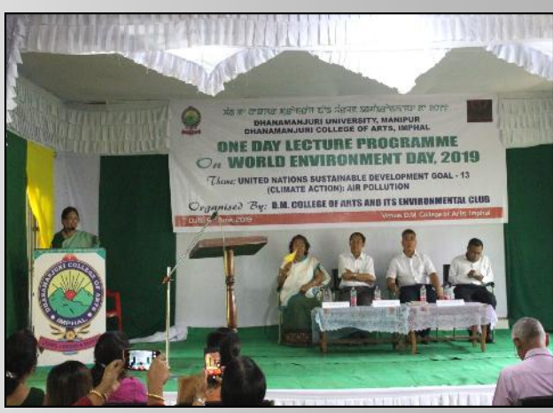
One Day Lecture Programme on World Environment Day held on 5th June, 2019