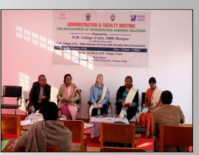
Administration & Faculty Meeting on "The Development of International Academic Relations" held on 4th Feb,2020