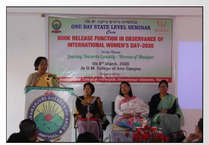
Book Release Function in Observance of International Women's Day held on 8th March,2020