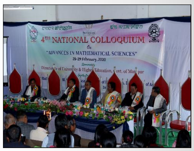
4th National Colloquium on "Advances in Mathematical Sciences" held on 28th and 29th Feb,2020