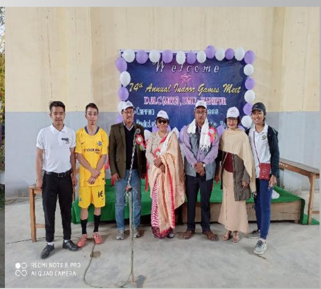
74th Annual Indoor Games Meet