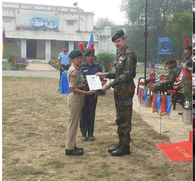
Distribution of Certificate on Completion of NCC Paratrooping training at Agra