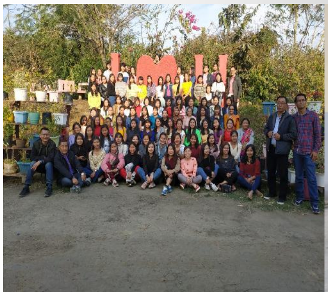
Girls' Hostel Educational Tour