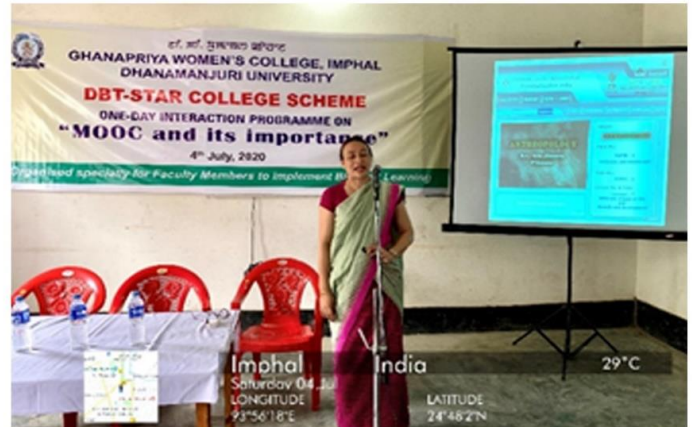
One Day Interaction Programme on "MOOC and its importance"