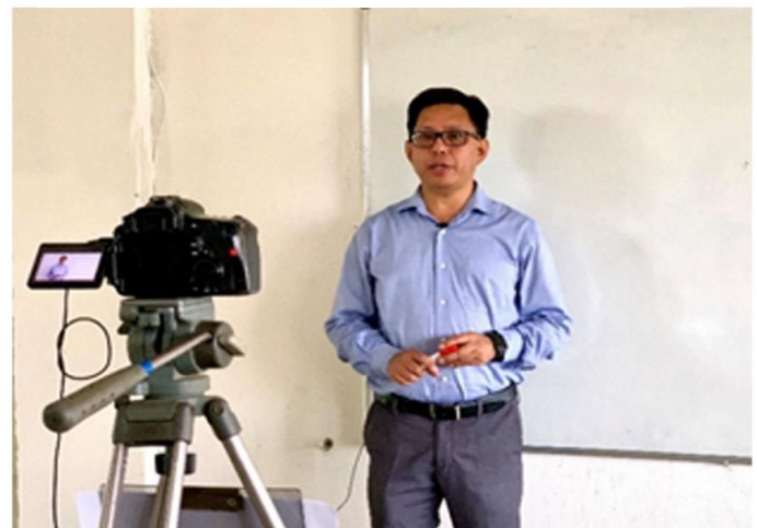
Recording for Online Video Classes