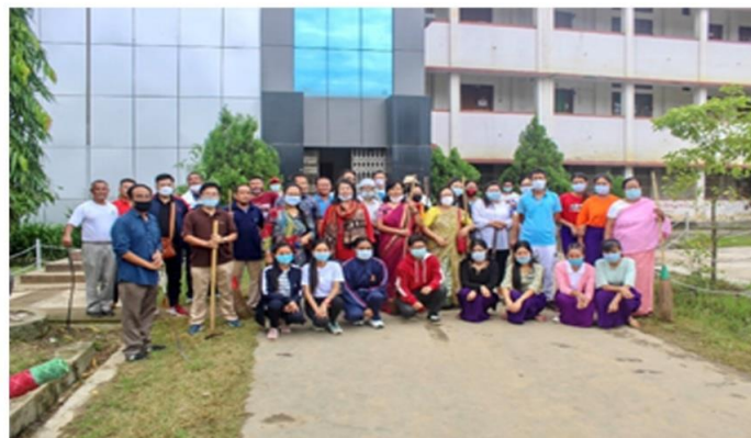
One day Social Service Programme