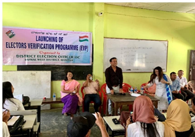
Launching of Electors Verification Programme (EVP)