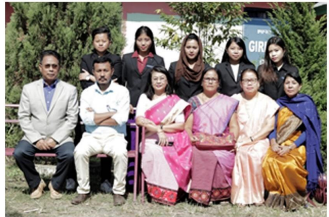
G.P. Women's College Students' Union