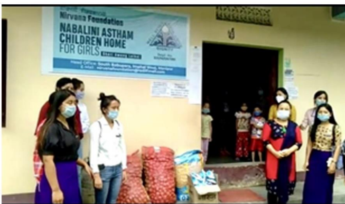
Distribution of certain edible items by Students' Union Secretaries to some selected Children Homes during COVID-19 Pandemic