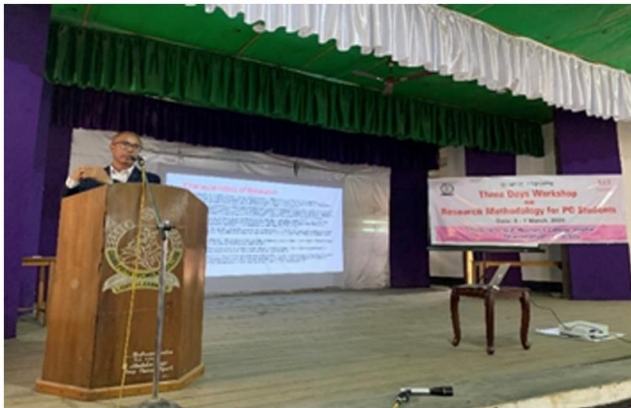
3-day Workshop on Research Methodology for PG students