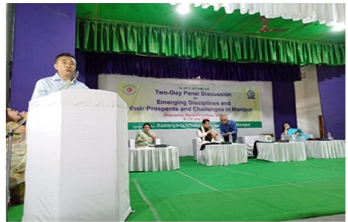
Two-day Panel Discussion on Emerging Disciplines and their Prospects and Challenges in Manipur