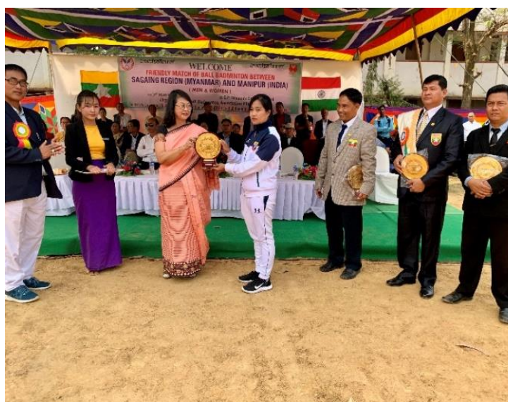
Friendly match Ball Badminton between Sagaing Region (Myanmar) and Manipur (India)