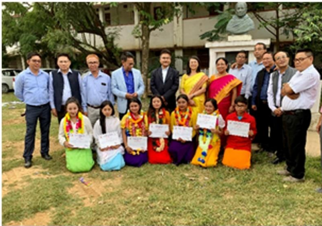
Winners of College Students' Union Election, 2019-2020