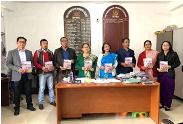
Release of College Magazine