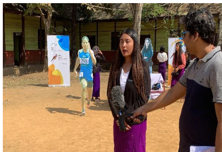
BBC Indian Sportswoman of the year, 2020