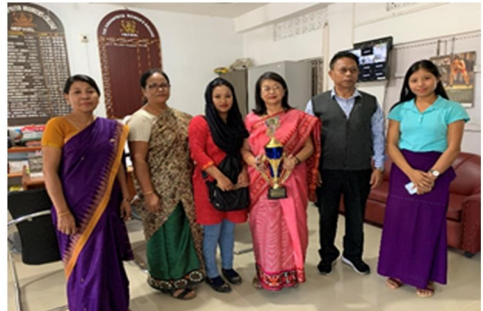
Handing over of Winner's Trophy of Youth Festival to the College Principal