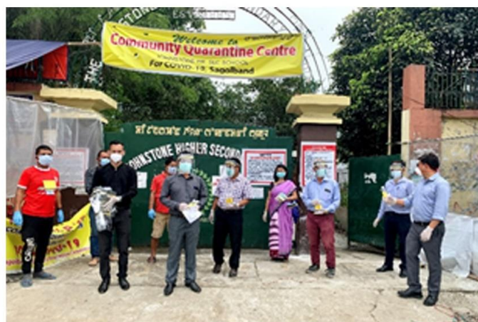
Distribution of certain protective kits to some selected quarantine centre to fight COVID-19 Pandemic