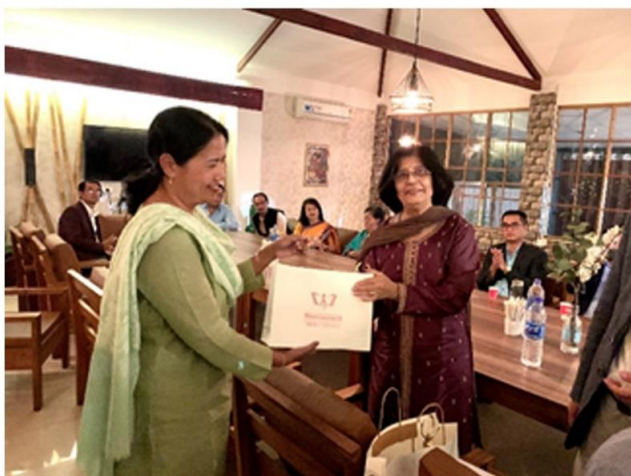
Launching programme of Korean Language in DMU