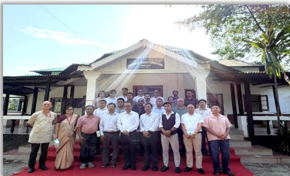
Office of the Dhanamanjuri University Student's Union (DMUSU) Inauguration Ceremony

The first convocation of Dhanamanjuri University, Manipur was held with great enthusiasm and dignity on 17 th January, 2026 at the university campus. The ceremony was presided over by Shri Ajay Kumar Bhalla, the Hon'ble Governor of Manipur & the Chancellor of Dhanamanjuri University. The event marked a significant milestone in academic journey of the graduating students and celebrated their achievements in the presence of distinguished guests, faculty members, students, parents and well-wishers. Altogether 794 students were conferred upon graduates & postgraduate degrees in recognition of their academic achievements.