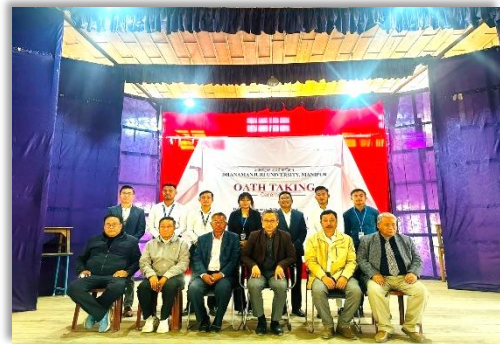
Oath taking ceremony of DMUSU, For the year 2025-26