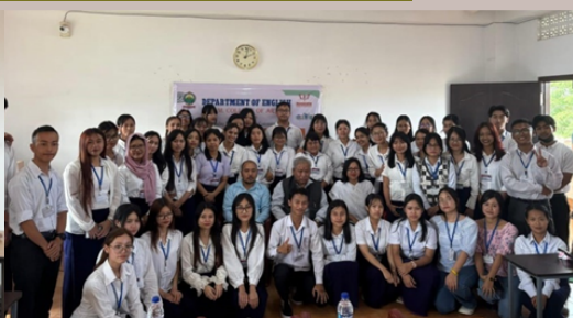
One Day Interaction Programme with young Manipuri poets organised by Department of English, D.M. College of Arts on 17 th May, 2025