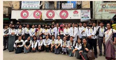
Internship Program for B.Sc. 6th Semester on Anthropology of Health (SAN012) Urban Primary Health Sub Centre, Thangal Bazar, Ward No. 25, Imphal West.