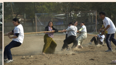
Dm College Of Commerce: College Week And Annual Social Fresher's Meet 2025