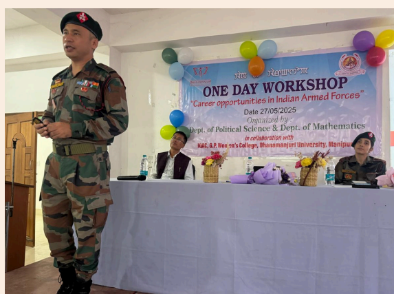
One Day Workshop on "Career Opportunities in Indian Armed Forces" organised by Dept. of Pol. Sc. on 27th May, 2025