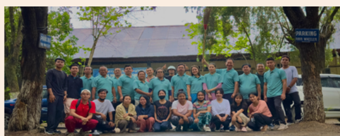
Cleanliness Program by Department of Anthropology, DMU on 15 th June, 2025