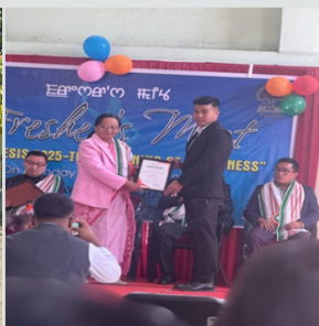
LMS Law College Freshers' Meet was held on 17 th February, 2025 on the theme "LMS Genesis 2025- the Beginning of Greatness."