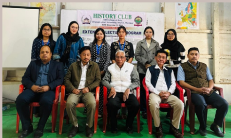
Extension Lecture Program organised by History Club, D.M. College of Arts

Activities of NSS Unit of D.M. College of Arts