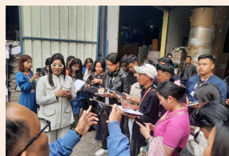
Department Of BBA, D.M. College Of Commerce: Industrial Visit To Kolkata From 19 th To 22 nd February 2025