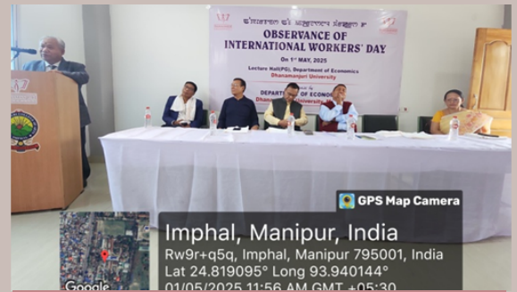
Observance of International Workers' Day on 1 st May, 2025, organised by Department of Economics