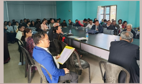
One Day Workshop on Inter-Cultural Resources of the Communities in Manipur organized by Department of Political Science, D.M. College of Arts and Yelhoumee Phurup, Manipur on 22 nd February, 2025.