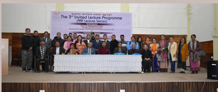
3 rd Invited Lecture of the ARF Lecture Series organised by Academic Research Forum, DMU and Dept. of Philosophy, DMU