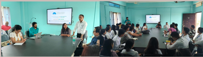
Department of Political Science, D.M. College of Arts took the initiative to conduct a Short Term Training Program on Civic Engagement and Democratic Process jointly organised by Indian School of Democracy and Dhanamanjuri University