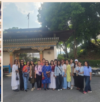
EDUCATIONAL TOUR TO BHUTAN 2nd – 7th May 2025