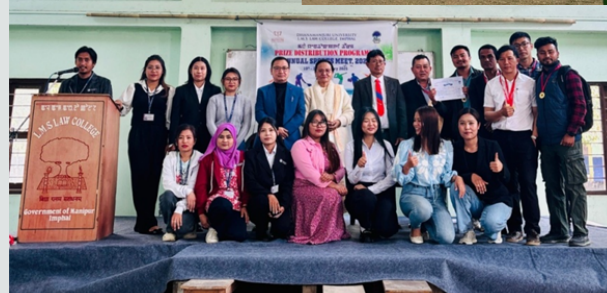
College Sports Meet and Literary Meet February 17 to 24, 2025