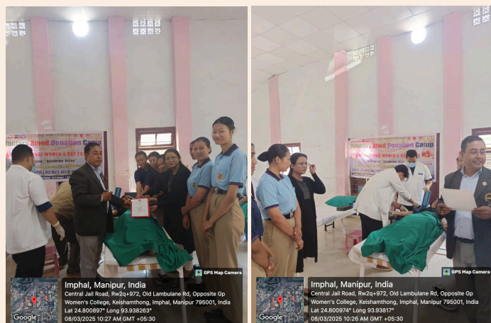
Blood Donation Camp on International Women's Day 8 th March, 2025 Organised by the NCC and NSS