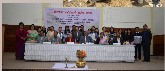
International Mother Language Day 2025 (Silver Jubilee Celebration) organised by Department of Manipuri, DMU on 21 st February, 2025