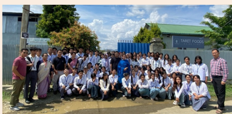
Business and Corporate Anthropology (SAN-004) Internship Program for B.Sc. 2nd Semester was carried out successfully at Taret Foods, Kairang Rd. Heingang, Manipur 795002