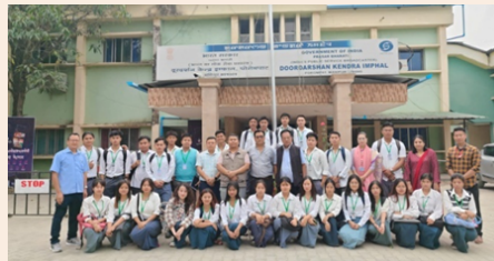
B.Sc. 4th Semester Internship Program on Media Anthropology (SAN-008) conducted at Doordarshan Kendra Imphal, Porompat, Manipur 795001